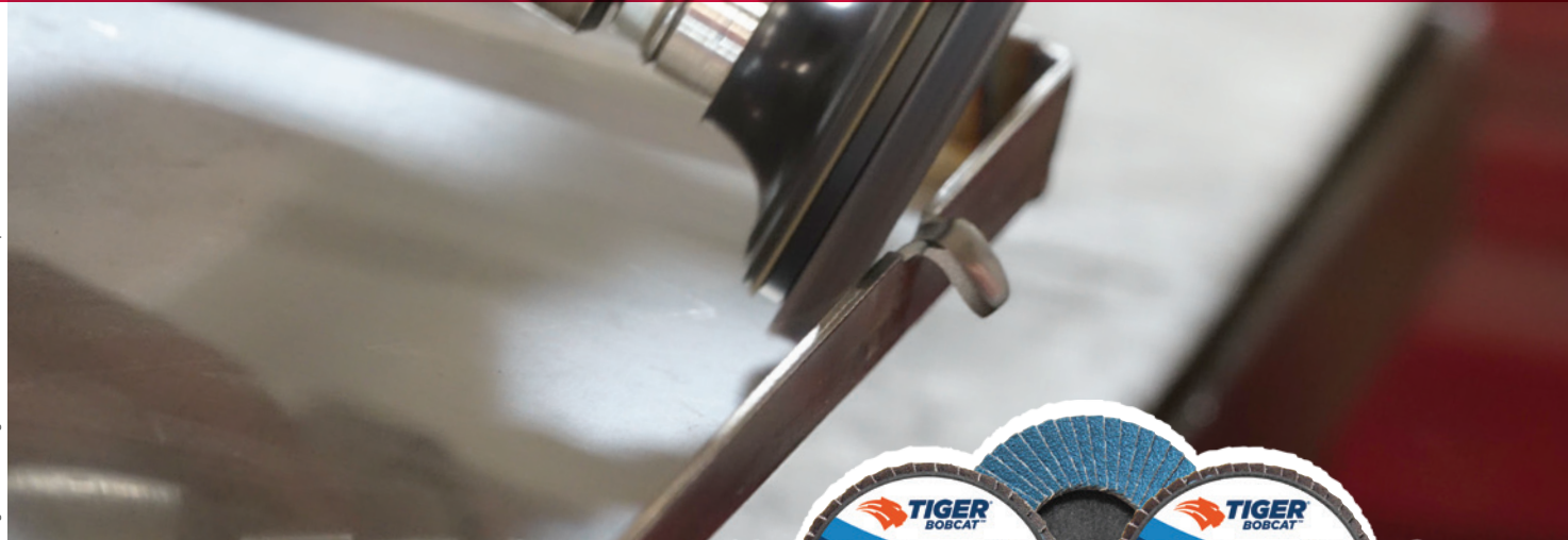
Edge chamfering a fabricated stainless component.